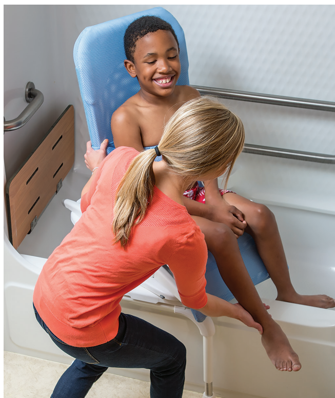
Rotating tub transfer base moves the user safely over the tub rim and reduces caregiver strain.