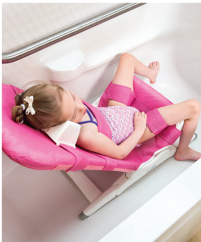
Backrest tilt adjusts from upright to reclined while the client remains supported.