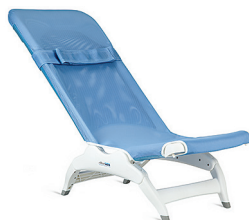
Large Z230 50–74" overall user height