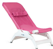
Medium Z220 40–56" overall user height