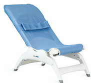
Small Z210 Up to 46" overall user height