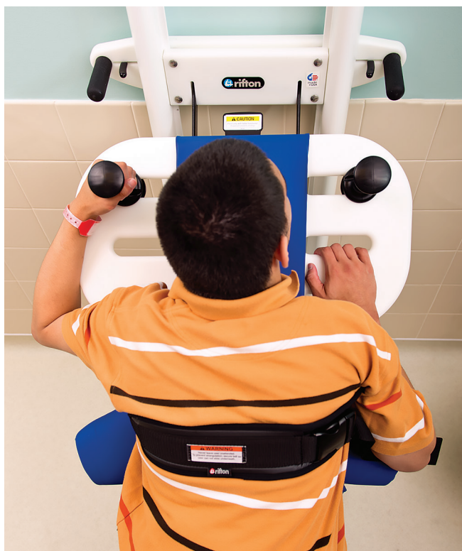
Handholds and slots on the trunk board let users assist with transfers.