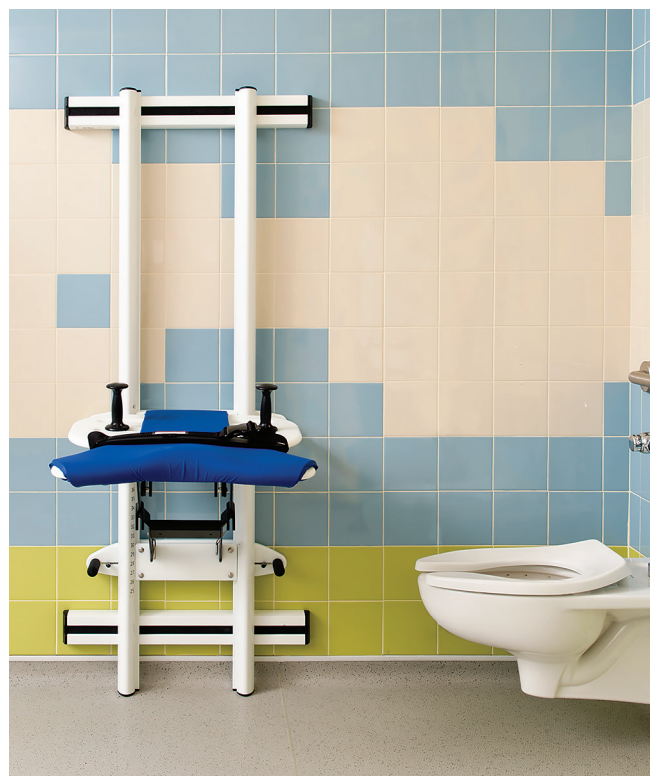
The pivot configuration (shown) enables rotating transfers from a wheelchair to a fixed toilet for users with adequate lower-body strength.