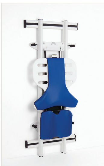
The Support Station folds flat against the wall when not in use.