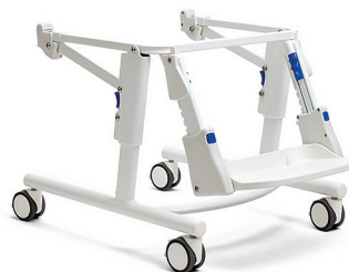
Mobile (non-tilt with footboard)