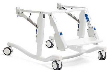
Mobile (tilt-in-space with footboard)