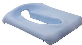
Soft seat pad