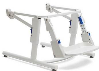
Stationary (non-tilt with footboard)

Note: check clearance if using over a toilet.