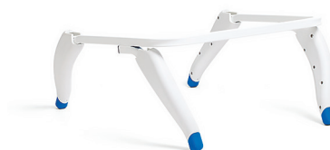
Tub base (non-tilt, for medium and small HTS seats)

Note: check clearance if using over a toilet.