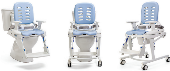
On the toilet

The HTS works on, over, or off the toilet—adapting seamlessly to any setting, any toilet style, and a wide range of special needs.