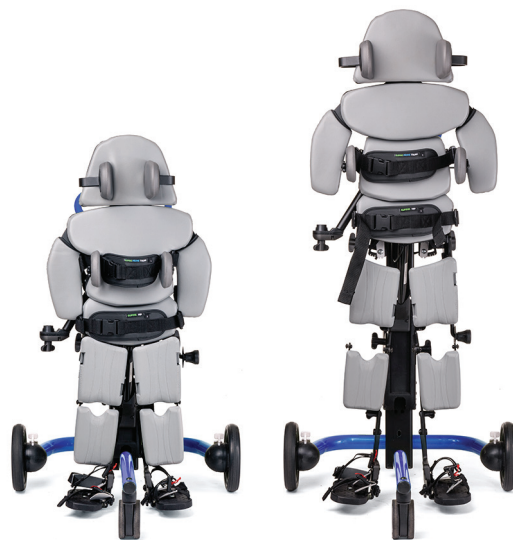
Size 2 range of adjustment