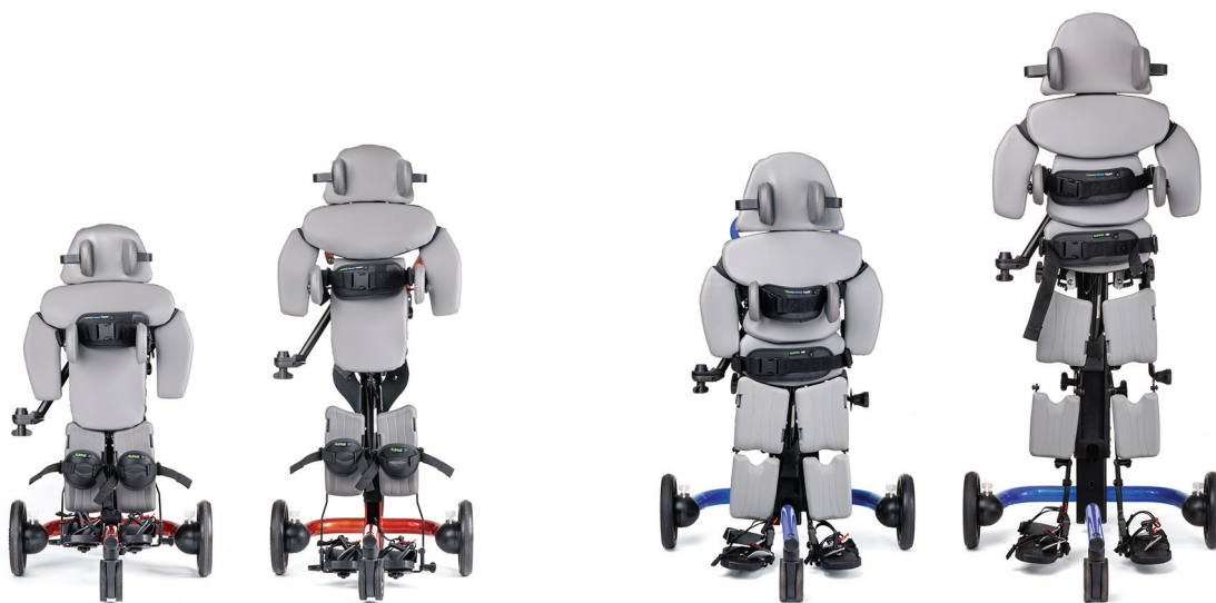
Size 1 range of adjustment