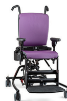
Large hi/lo base R870 Rifton Activity Chair