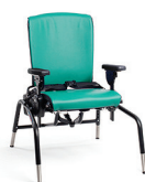
Large standard base R860 Rifton Activity Chair