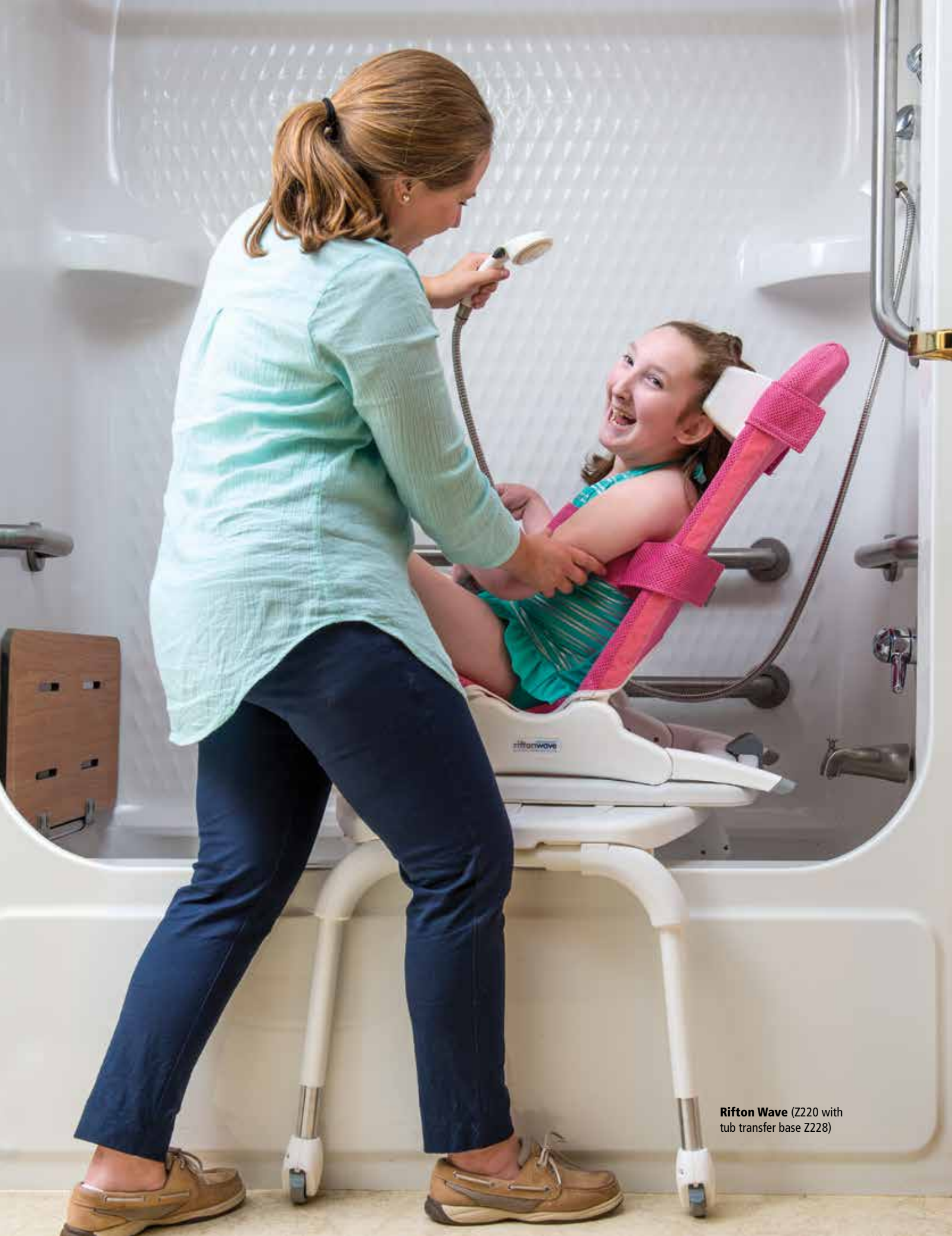
Rifton Wave (Z220 with tub transfer base Z228)