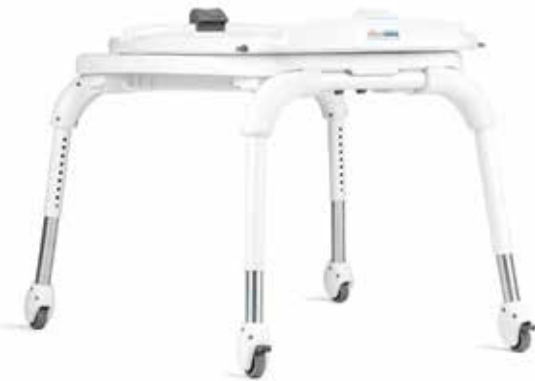
Tub transfer base available Summer 2017