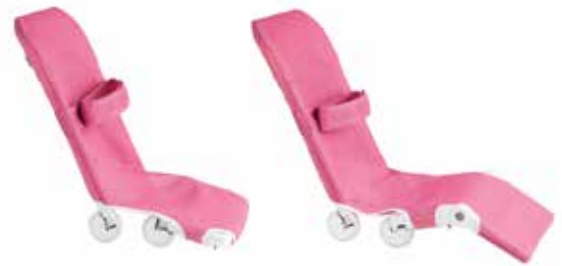
Without calf rest (Z269)