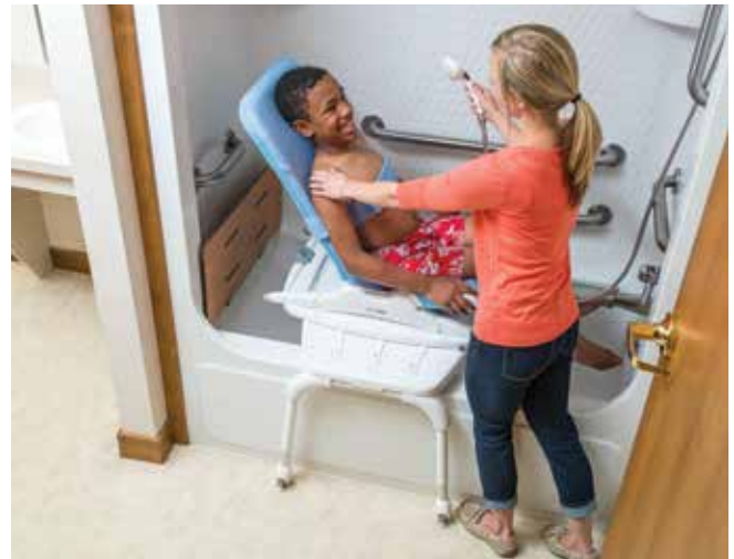
4. In the final position the bath chair is over the tub, and can be adjusted as desired before showering.