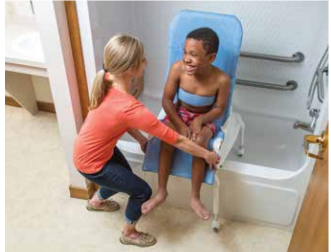
2. Press either of the gray pivot latches on the transfer base and start to rotate the bath chair and client over the tub.