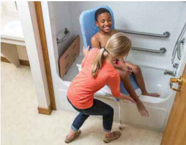
3. As the bath chair rotates, it continues to move back over the tub. Gently lift the client's legs to clear the edge of the tub.