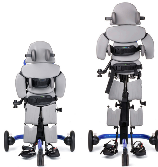
Size 2 range of adjustment