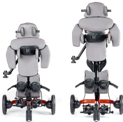
Size 1 range of adjustment