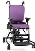
Large hi/lo base R870 Rifton Activity Chair